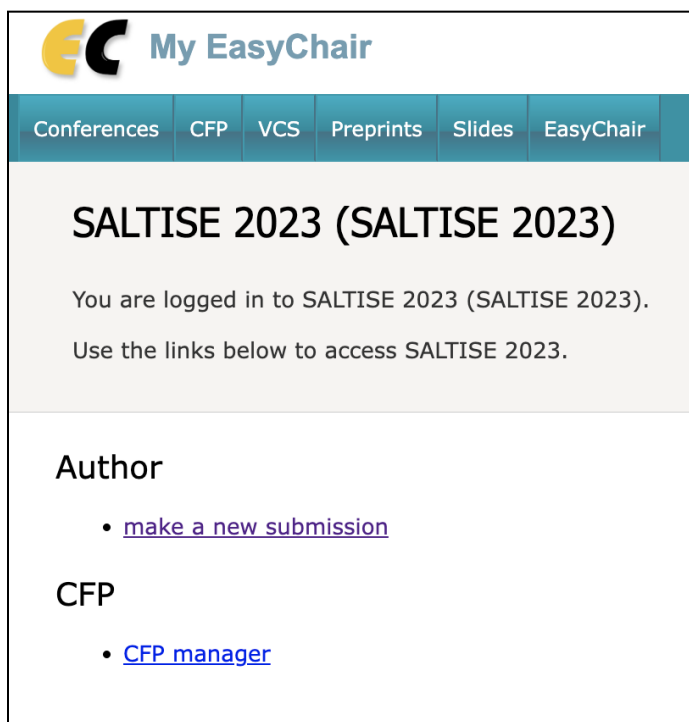
Figure 3: The main page for authors