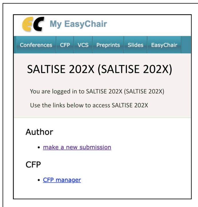
Figure 3: The main page for authors